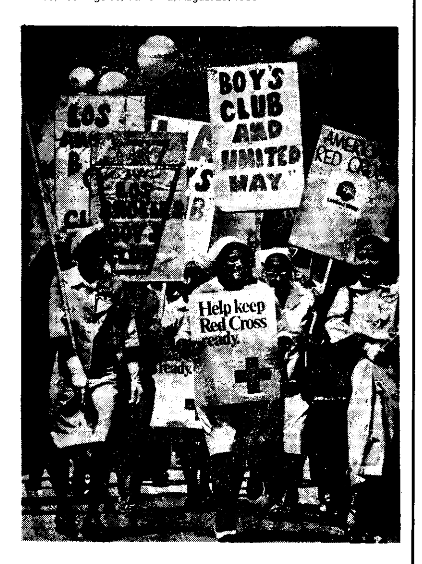
PARADE—Representatives of some of the 250 United Way service agencies march in Lafayette Park to kick off 1980 campaign. Goal for drive, which begins Sept. 15, is record $56.1 million in Los Angeles County and parts of Kern and San Bernardino counties.

Times; Los Angeles, California; August 29, 1980