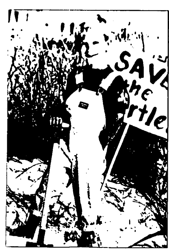
Even very young children may enjoy volunteer work.