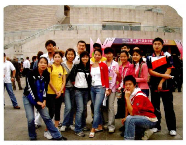
参加第二届北京国际美术双年展志愿者合影 Volunteers have a group photo on the Second Beijing International Art Biennale