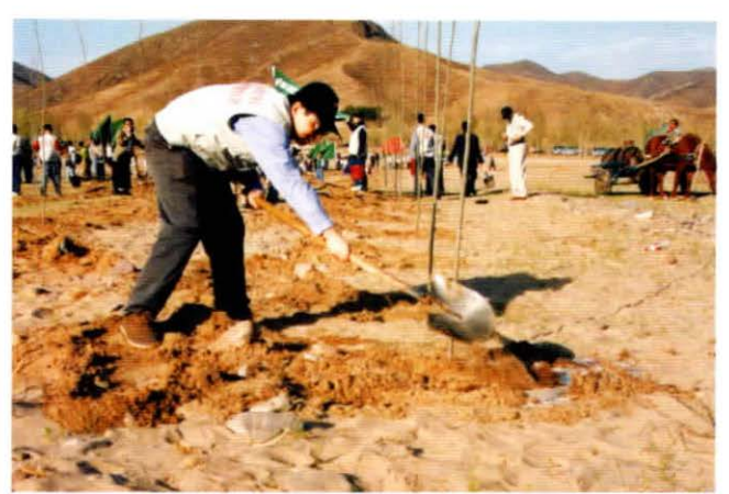
志愿者在荒山上植树 Volunteer are planting trees on barren mountains

近些年来,北京团市委、北京志愿者协会每年都会集中组织青少年或面向社会招募志愿者进行植树造林、沙漠治理、水污染整治、清除白色垃圾等环保志愿服务活动。据统计,截止到目前,参加绿化活动的青少年达600多万人次,共植树3000万棵,种草740万平方米,种花2100株,开辟回归纪念林、民族团结林、新婚纪念林、青年林等20多处。