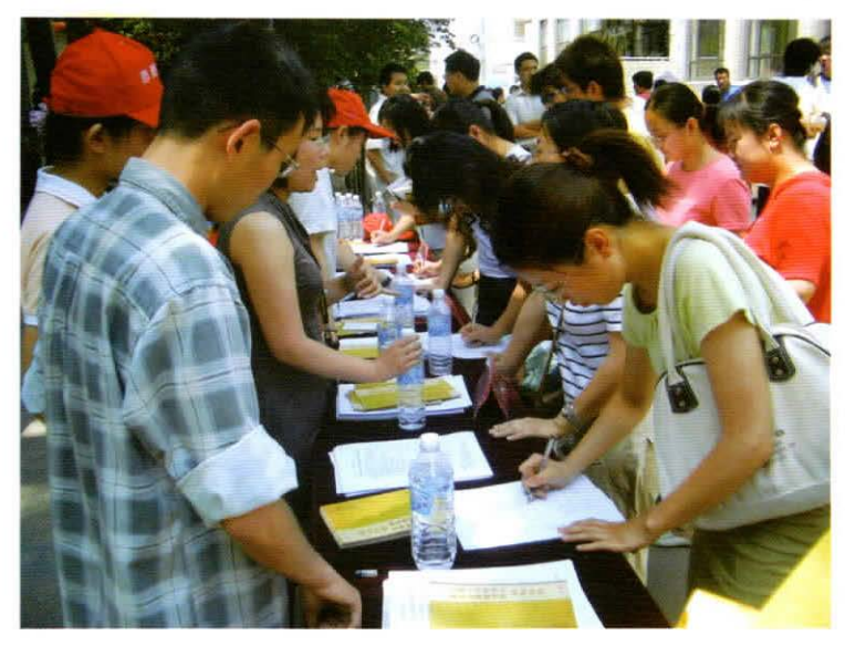
志愿者现场注册报名 Students are registering to be volunteers