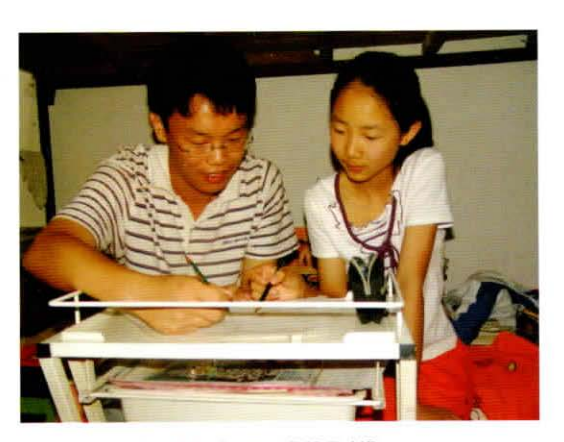
首经贸志愿者帮助烈士后代辅导功课 A volunteer from Capital University of Economics and Business is helping children study

In order to let the immigrant employees' children accept systematical and equivalent education as their peers, BVA started the project of voluntary service for "Love help children growth" in October 2005. On 19th October, the project of voluntary service for "Love Help Children Growth"-English teacher training course of immigrant employees' children school starts to work in the Beijing Giant School, the English teachers come from seven schools for immigrant employees' children, received the training. The Project will develop the training courses including the immigrant employees' children's education psychology, traditional culture, civilized etiquette training, and in order to improve the teacher's quality of the school for immigrant employees' children. Meanwhile, it will help the immigrant employees' children school establishing their own youth league branch. Depending on the youth league branch, they can develop plentiful and colorful extracurricular activities, and jointly help the immigrant employees' children grow healthily.