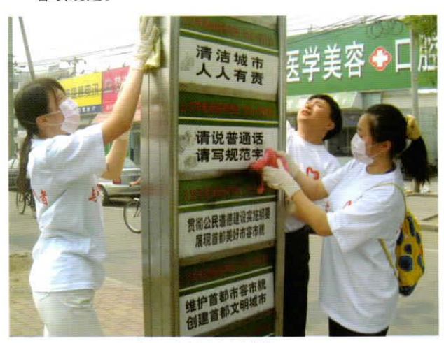
志愿者在北京街头清洗公交站牌 Volunteers are cleaning up the bus boards in the street Beijing