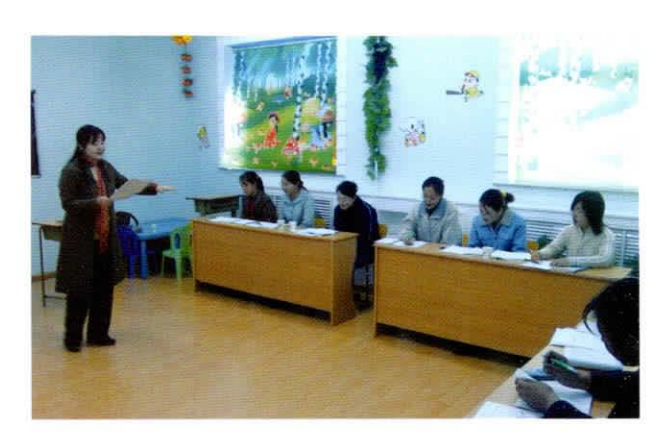
志愿者在培训打工子弟学校的英语教师 Volunteer training the english teacher from the schools for immigrant employees' children