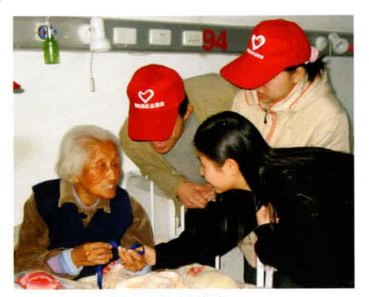
志愿者与老人亲切交谈 Volunteers are talking with the old man intimately

From 1997, the BVA and Beijing Committee of China Communist Youth League Beijing Committee organize university students to return to hometown during winter and summer vacations to provide voluntary service to the poverty-stricken and remote areas, where economy and education are backward. The student volunteers participate in activities including conducting theory propaganda, supporting agriculture with science and technology, joint building of community, enterprise management, medical care service, environmental protection, and education support and illiteracy elimination, etc.. During this process, they not only contributed to the development of the motherland, but also learnt and improved a lot. Every year, over 100,000 students in the Capital participate in the social practice of voluntary service activities annually. More and more students are involved in the project year by year. Moreover, over 100 voluntary service teams are organized to conduct the Actions of Contribution to the Capital, with a focus on the modernization of the capital, providing voluntary services, such as community joint building, service for the outskirts of Beijing, environmental protection, and so on.