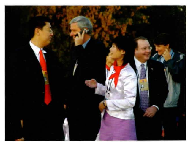
财富论坛志愿者在服务 Volunteers of Fortune Global Forumare providing service