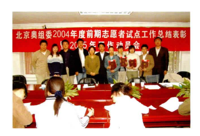
北京奥组委2004年度志愿者工作表彰总结会 Conclusion and commending conference of volunteer work of BOCOG in 2004