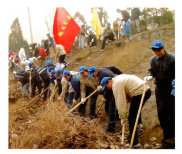
志愿者清理排洪渠 Volunteers are clearing up the flood relief channel