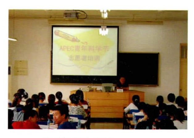
APEC青年科学节志愿者培训 Volunteers of the 3rd APEC Youth Science Festival in training