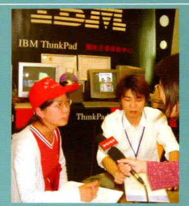
经济普查志愿者接受采访 Volunteers of the economic census are being interviewed