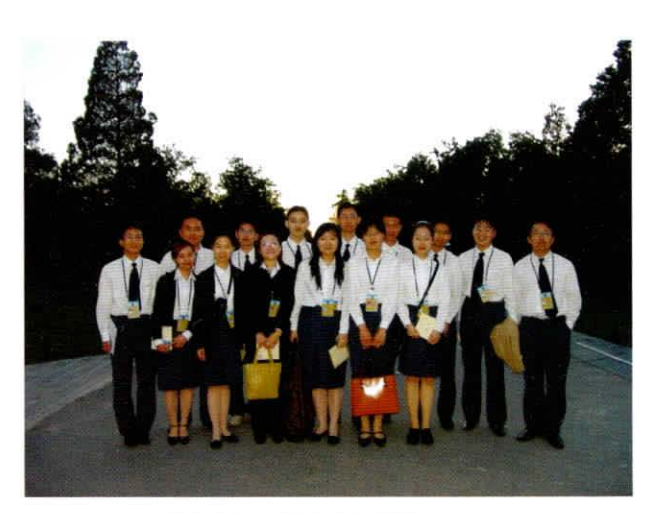
2005年财富全球论坛志愿者合影 Volunteers have a group photo on 2005 Fortune Global Forum

2005年3月,共青团北京市委联合北京志愿者协会按照北京《财富》论坛组委会的指示,在清华大学、北京师范大学、北京外国语大学、中国传媒大学、对外经贸大学招募了228名志愿者提供为期近十天的志愿服务工作。志愿者们经过一系列的志愿服务理论知识培训和实战演练,被分配到论坛的内宾接待组、外宾接待组、宣传组和会务组。提供文档管理,信息处理,内宾联络,外语翻译,新闻旅行团、配偶旅行团的陪同,论坛宴会、酒会服务等专项志愿服务。志愿者的突出表现受到了各方用人单位的好评。