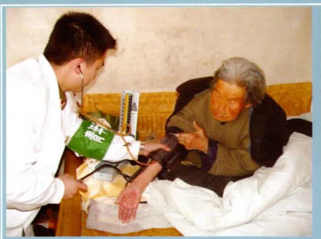
志愿者在社区中开展义诊活动 Volunteers are providing free medical service in the community