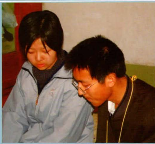
志愿者为社区贫困居民子女提供义务家教服务 A volunteer is providing free family tutoring to a schoolgirl