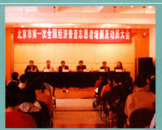
北京第一次全国经济普查志愿者在人民大学接受培训 Volunteers of the first National Economic Census are being trained in Renmin University of China