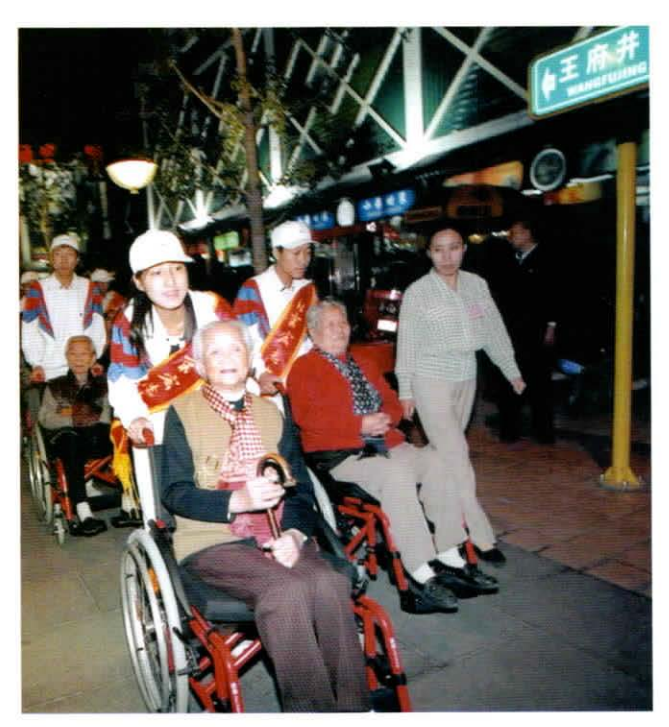
中学志愿者陪孤寡老人逛王府井 Volunteers from middle schools are accompanying with the bereaved elders to visit Wang Fujing Street