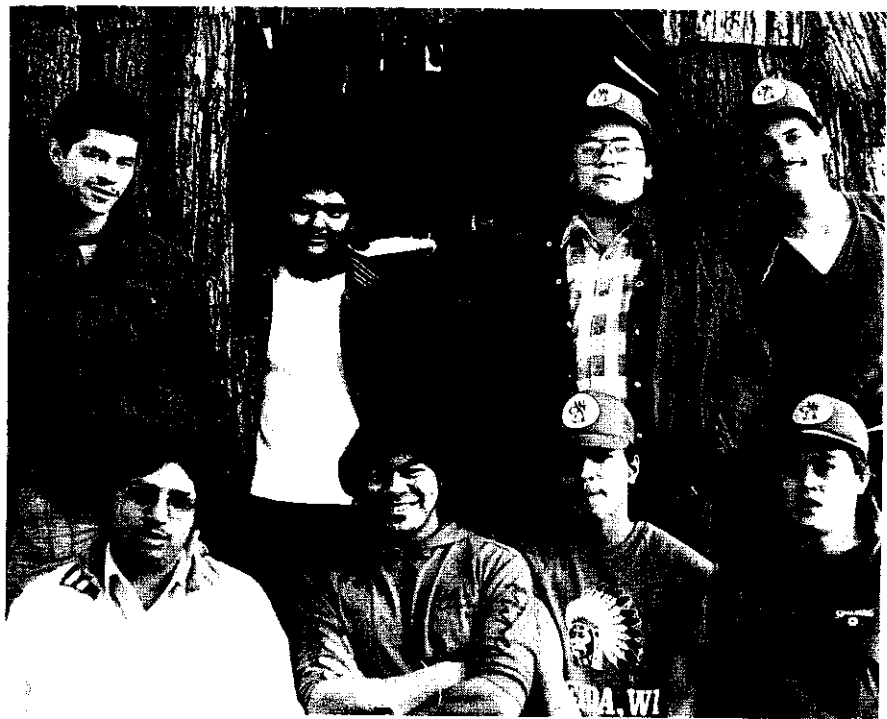
Wisconsin Conservation Corps, Oneida Reservation

Minnesota's 1987 Youth Development Act encourages local communities to develop community service programs for young people. Local Community Educa-