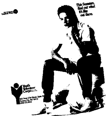
Youth Corps of Greater Kansas City recruitment flyer