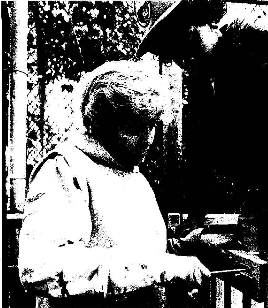
San Francisco Conservation Corps

tion Advisory Councils may set a levy of 50 cents per capita to fund community-wide youth development plans. Some 160 school districts have opted to set the levy, and many include youth community service programs in the overall plan. For example, school districts in the Minneapolis area have raised $180,000 for school-based youth service programs through the levy legislation.