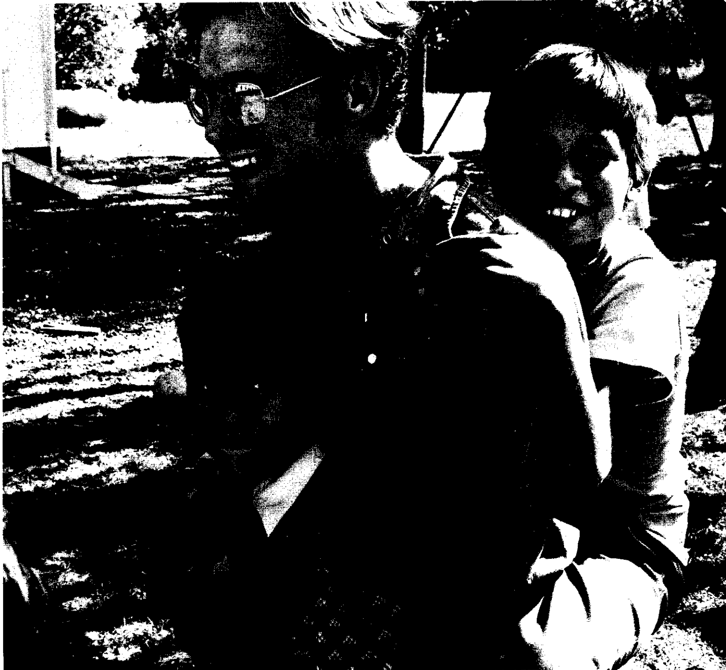
University Year for ACTION, Nebraska