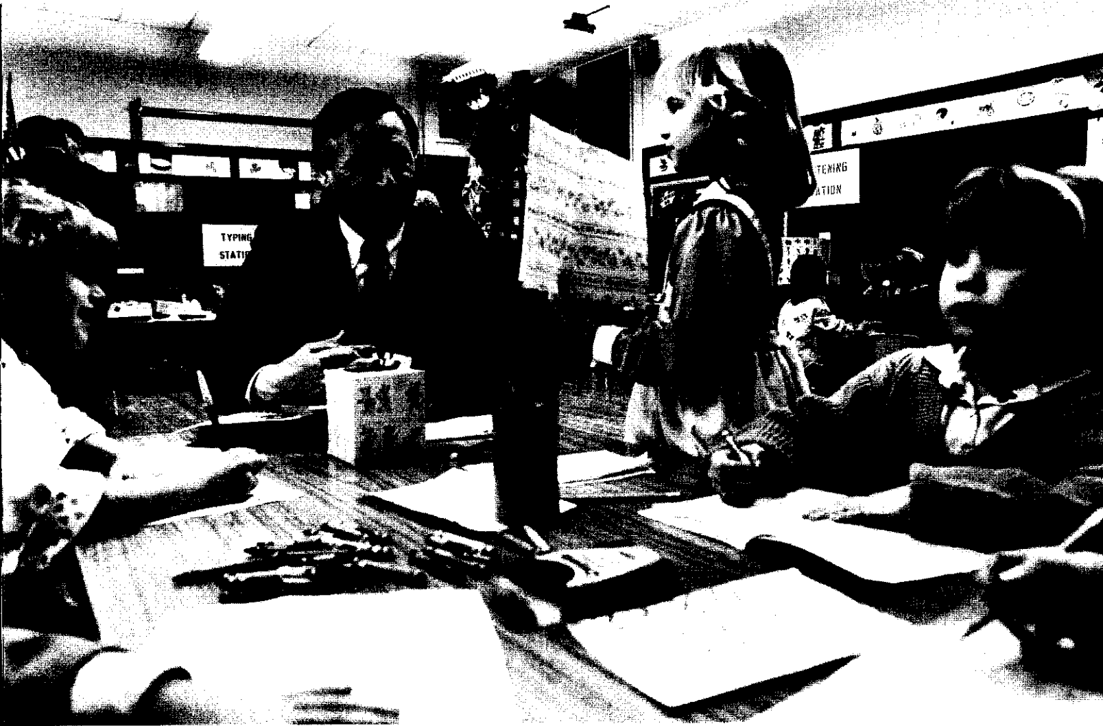
Governor Celeste and friends, Ohio

"We're at a crossroads where I think many signs point to increased volunteer service. My question is whether we're going to choose the right road. It does really make a difference for the future of this country. We as a nation have to open broad avenues for public service, not some narrow highway. Think for a moment about the young people of this country, particularly those several million young people who today are looking for work and can't find it. Think of the 20% or 30% or in some places 40% of our students who are beginning high school this year who are virtually earmarked for failure and will drop out before schooling is over. Think of the three million young teenagers who have special needs today, involved in alcohol or drugs, involved in crime, involved in premature parenting. Our challenge is to see them not simply as the objects of service, although they may often be, but as service volunteers. Everyone can be a volunteer and everyone learns in the process of being a volunteer in profound ways. We can, if we really work with educators, open their minds to the opportunity for service learning as part of everybody's education in junior and senior high school. No learning is better, no learning is more valuable, no learning will last longer."