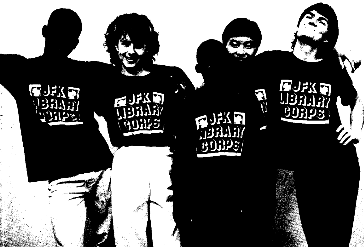
John F. Kennedy Library Corps, New York

"I want to reinforce the importance of service for young people as a self-esteem builder. Children need to feel useful. They need to find their place and role in society and in the community. They need to feel that they are contributing something. They need to have that contribution to society recognized and society needs them to contribute. . . . Another reason why service is terribly important is leadership development. It is where we learn to deal with problems in the world. It opens our eyes to the fact that individuals can make a difference. . . . The point is to serve. Not to win, not to succeed, not to fear risking or failing, but to serve. Nobody told us we're ever going to win, but they did tell us we have to make that effort."