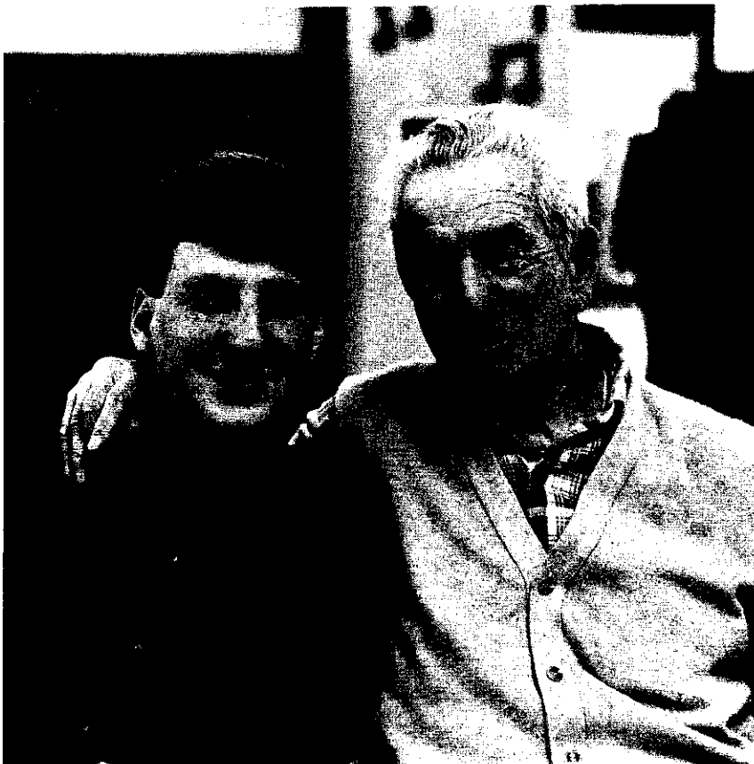
Ramapo High School, Ramapo, New York

vania and Maryland, now have full-time state Department of Education youth service coordinators to promote service initiatives in the schools. In Vermont, school-based service has been spurred by a zealous champion outside the education community with the encouragement and backing of the governor.