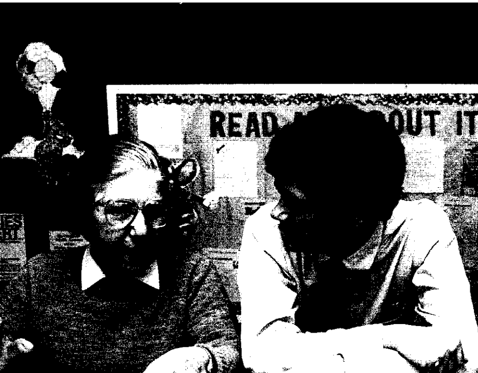
Student community service, Prince George's County, Maryland

Another initiative, according to Secretary Wofford, encourages those receiving unemployment compensation to volunteer for community service. Among the original group of volunteers, one-fourth received paying jobs immediately and one-fourth have good job prospects. Further, 80% said they would continue to volunteer.