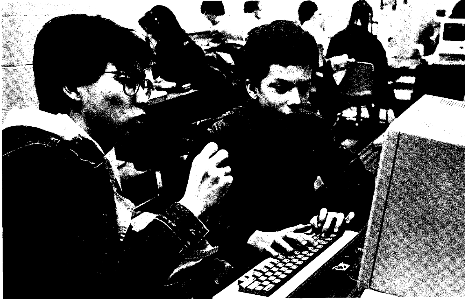
Campus Compact, Rhode Island School for the Deaf

"We can move toward universal service not by compulsion but by asking in a powerful way for everybody to serve. Governor Casey has set a goal in Pennsylvania of building a system of service in which we ask everybody to serve. The governor believes that community service should be part of the school curriculum to enrich both education and citizenship. Spreading service programs through the education system is a central part of our state plan because you can ask everybody to serve without great cost. We have a Pennsylvania Conservation Corps which we are expanding. The governor wants to promote service corps in communities all around the state. We are tremendously interested in the Campus Compact because we believe we can combine the college students and high school kids working in communities where the needs are greatest. We welcome the competition with Minnesota. Competition between our various programs and states will help us move toward the day when a year or more of service to one's own community or to the international community is a common expectation of coming of age in this world."