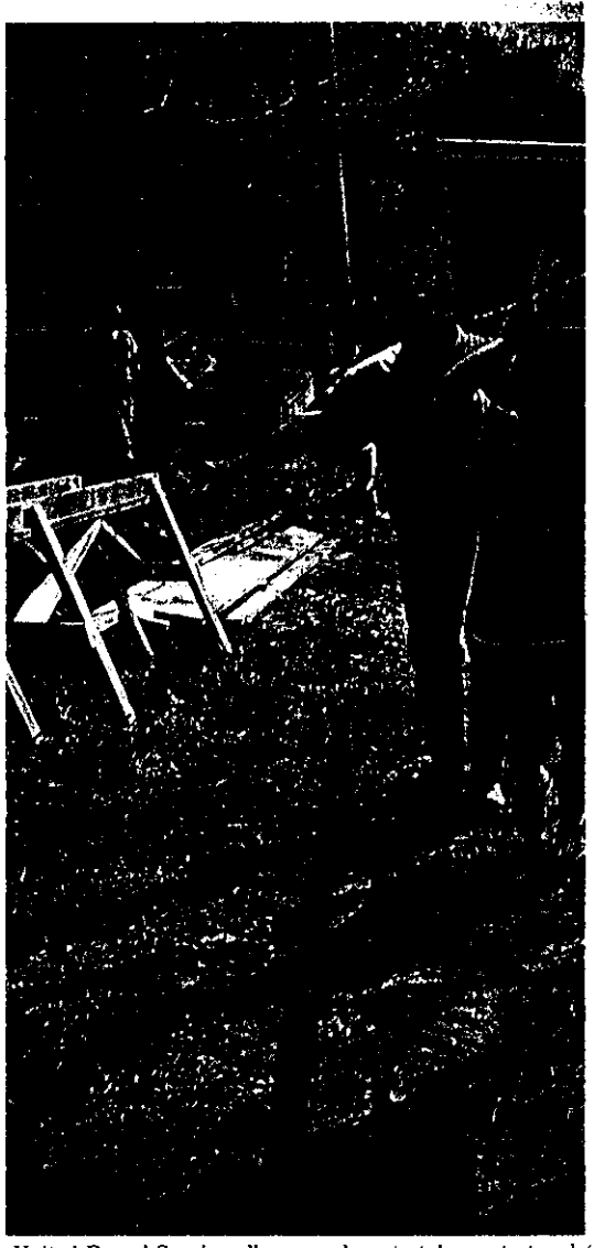
United Parcel Service allows workers to take up to two his volunteer. It also encourages community service among Above, employees help build a house at a Habitat for Hu

While volunteers are often perceived to be a source of free labor, they rarely are. A study of Big