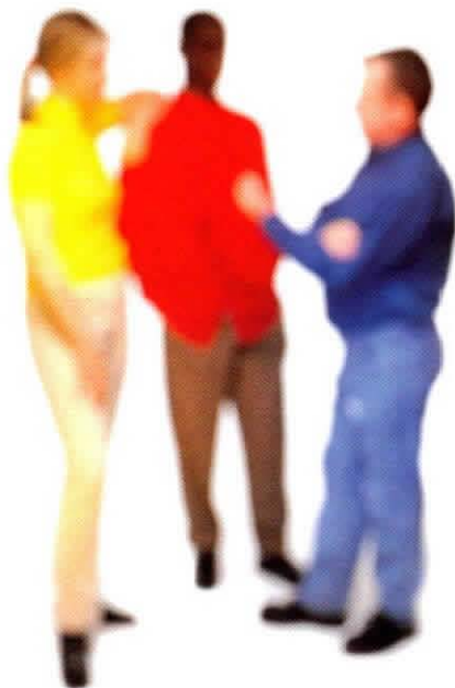
The Rt. Hon. Tony Blair MP