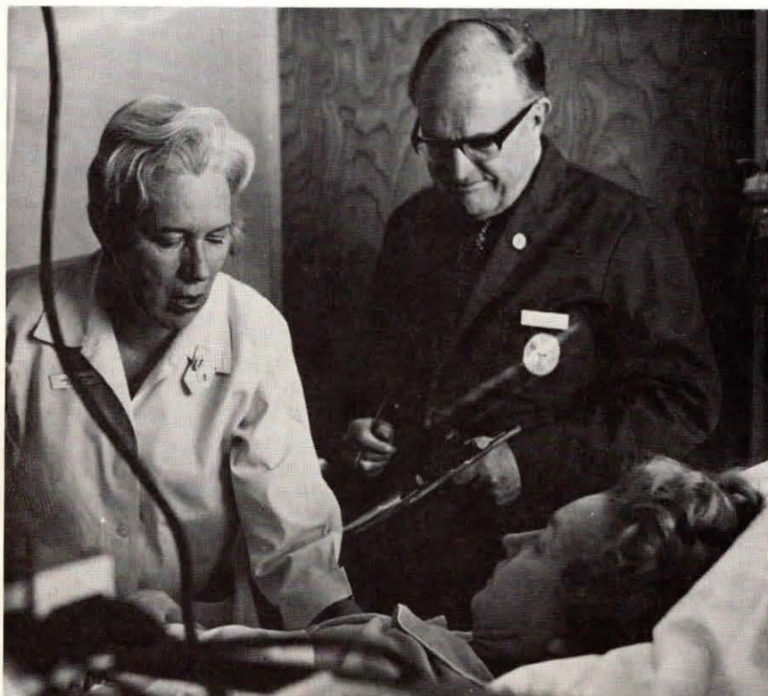
Males and older persons continue to make outstanding contributions to the health care field through their volunteer efforts.

The importance of attaining and maintaining better health has been stressed in classes and seminars that addressed a wide variety of subjects for varied participants. One volunteer organization set up a display of community health services by opening up a storefront and demonstrating the services available to healthy as well as sick people. 31 Some volunteer groups have worked to explain health careers to students, and some have carried this a step further by making scholarship monies available. Educating new mothers in the need for immunizations for their babies