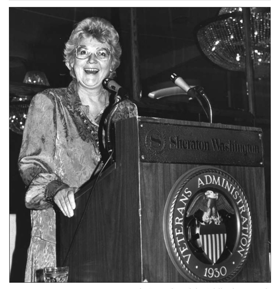
The "crone-in-training" delivering a speech.

...the truth teller at the crossroads—the wise woman who has gone through her many crossroads of life and has reached a place of conscious surrender where her ego demands are no longer relevant. She is not indifferent or withdrawn but totally present. She can be who she is and live her naked truth—to be a tuning fork to others.<sup>2</sup>