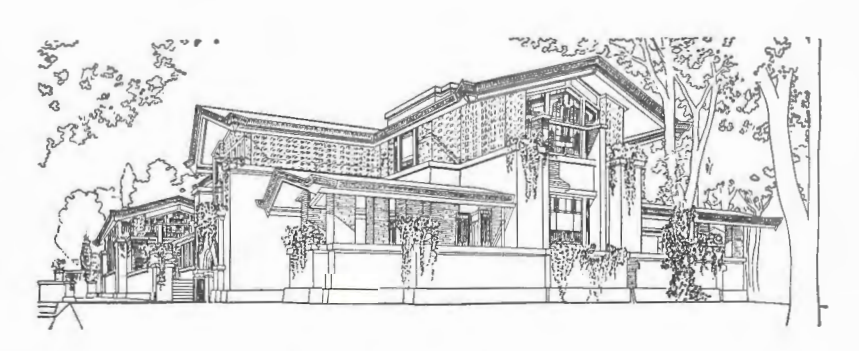
CHARLES C THOMAS • PUBLISHER Springfield • Illinois • U.S.A.