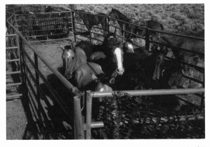
Some of the 80 wild horses gathered and removed with help of volunteers on Pine Valley District of Dixie National Forest.

In one instance, ranchers rode horses into a remote site to assemble and install a watering tank after the parts were delivered by helicopter.