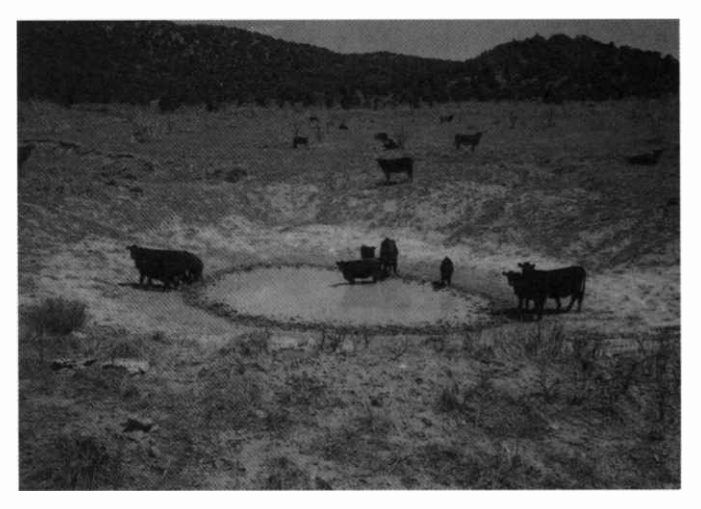
Water catchment area created with help of volunteers in Dedicated Huner program on Pine Valley District of Dixie National Forest. To seal bottom, district employees lined pond with blue clay to retain water (lighter color).

Less formal than the Dedicated Hunter Program is the relationship the range program of the Pine Valley District has with the Escalante Valley Wildlife Association. This is a group of local rural people interested in enhancing the environment primarily for wildlife and secondarily for cattle. They approached the District with their offer of help and have completed numerous spring developments and associated fencing, water catchments, and sign installation, along with litter clean up around a prominent reservoir.