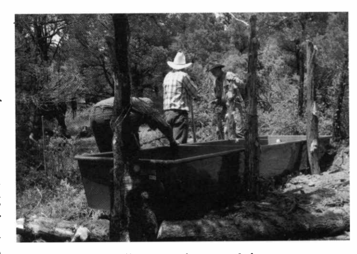
Volunteers installing watering trough in a remote area. Trough was helicoptered to site.

For example, there are many groups these days interested in improving habitat and forage conditions for wildlife. There are groups interested in helping protect endangered species – plant as well as animal. There also "partner" programs where other agencies or groups have formal relationships to sup-