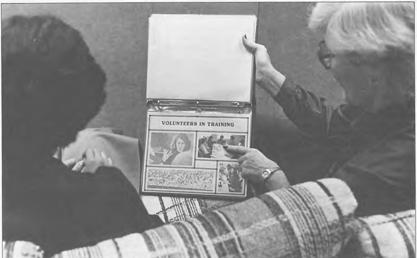
WICS volunteers and employees use the newly developed Volunteer Orientation Portfolio (VOP) in 156 field offices around the nation to recruit new volunteers, orient them to the program, and describe the specific jobs for volunteers.

The VOP works for us. Many of the ideas incorporated in our portfolio can be adapted by organizations with similar needs. For further information, contact Women in Community Service, 1900 N. Beauregard St., Suite 108, Alexandria, VA 22311. ♥